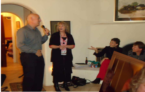
Announcing the Peter Attarian Award Recipient