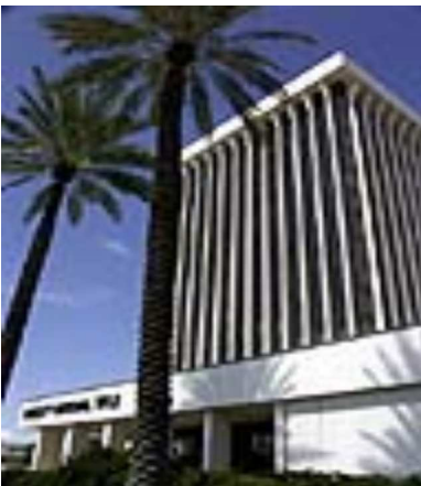
5151 East Broadway Blvd.