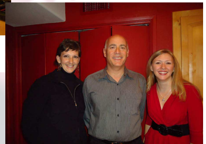
Past & Future Presidents